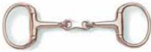
Eggbutt Snaffle with french mouth