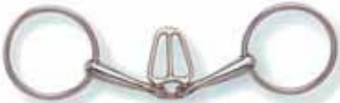
Tongue Control Bit