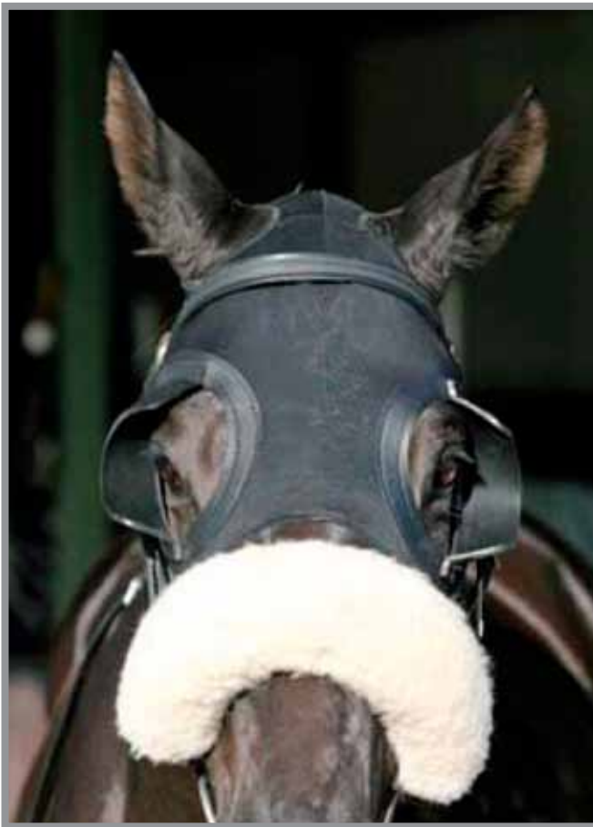
Blinker/Nose Roll Combination