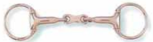
Dressage Eggbutt with french mouth