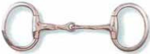
Slow Twist Eggbutt with flat rings