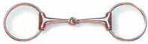
Loose Ring Eggbutt