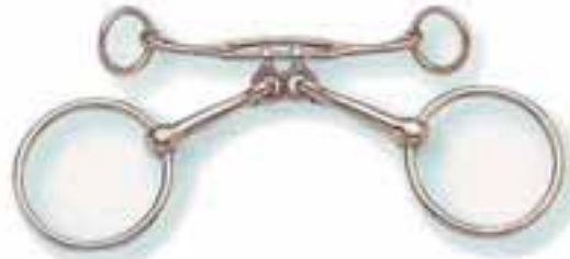
Victor Racing Bit