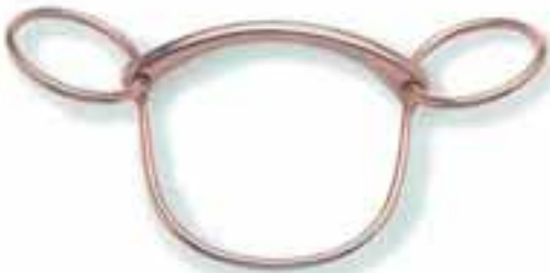
JR Lugging Bit