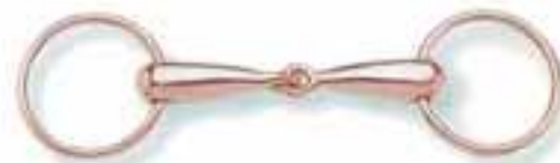
Thick Hollow Ring