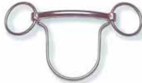
Brad Lugging Bit