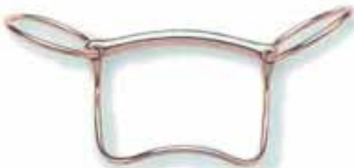
AC Lugging Bit