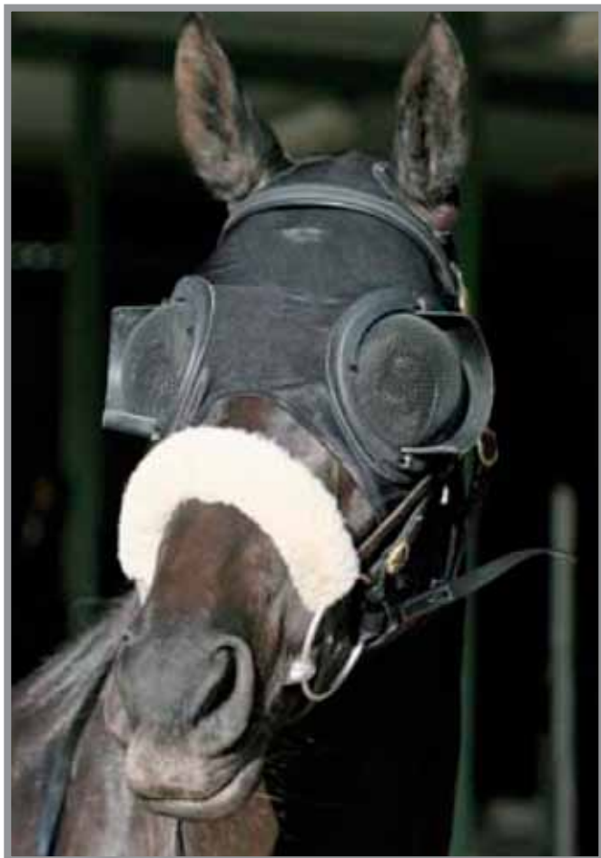
Blinker/Pacifier/Nose Roll Combination

All items may be used in conjunction with ear muffs.