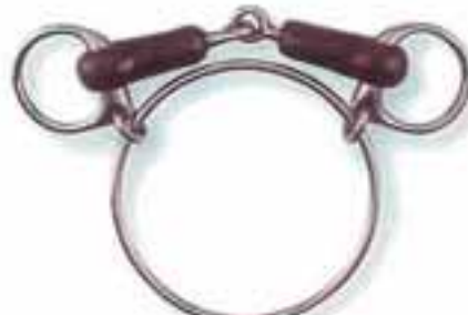
Dexter Ring Racing with rubber covered snaffle mouth