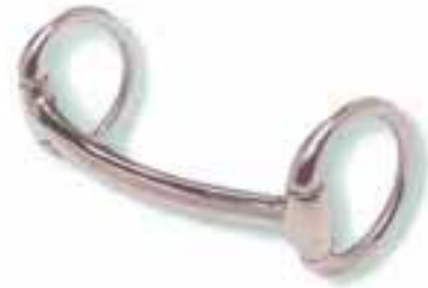
Mullen Mouth Eggbutt with small round rings