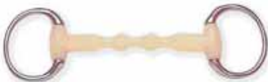
Apple Mouth Round Ring Eggbutt with flexible mouth