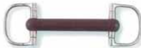
Racing Dee Bit with soft rubber Mullen mouth, must be reinforced with steel through centre