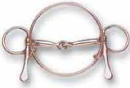
Half Spoon Ring Dexter