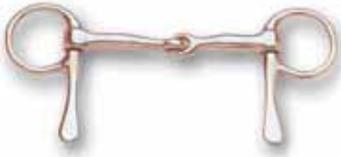
Half Spoon Snaffle