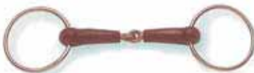
Loose Ring Snaffle with rubber covered Snaffle mouth