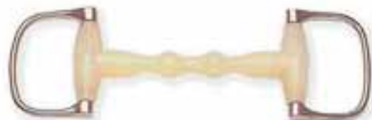
Apple Mouth Racing Dee Bit with flexible mouth