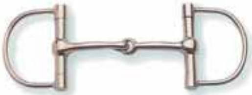
Racing Dee Bit