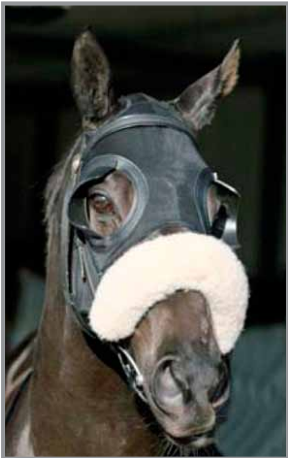
Blinker/Nose Roll Combination