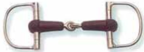
Racing Dee Bit with rubber covered snaffle mouth