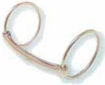
Loose Ring Mullen Snaffle