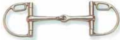
Racing Dee Bit with inside loops