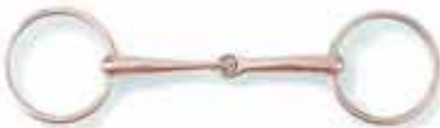
Thin Mouth Ring Snaffle