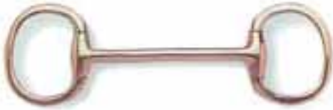
Mullen Mouth Eggbutt with large flat ring mouth