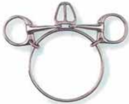
Dexter Ring Racing with tongue control