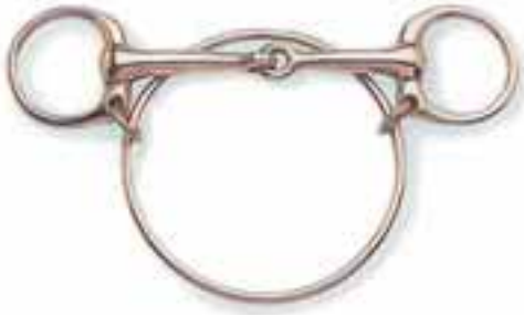
Dexter Ring Racing