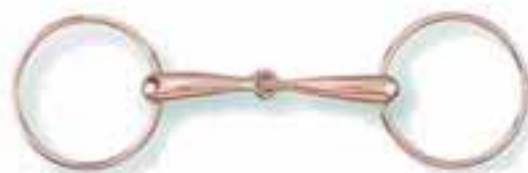
Thick Hollow Ring