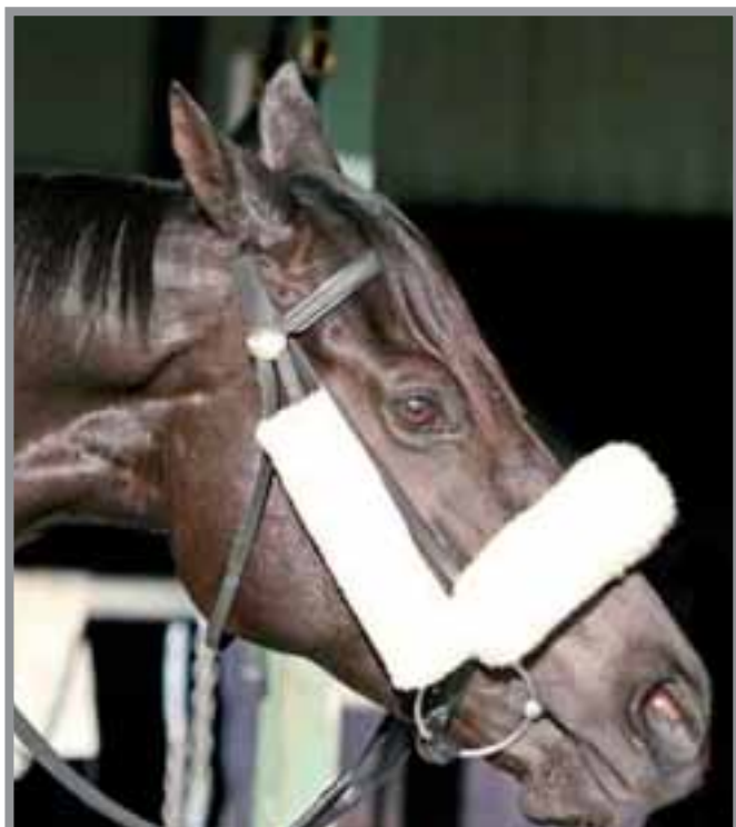
Winker/Nose Roll Combination