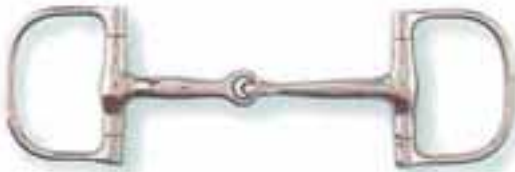
Racing Dee Bit with small Dee mouth