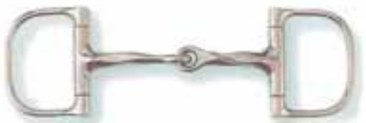
Racing Dee Bit with slow twist mouth