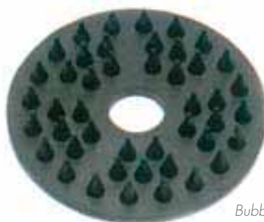
Bubble Cheeker, must be of a design approved by the Stewards and have no sharp edges.