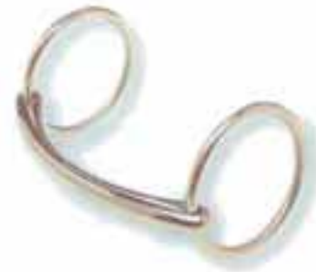
Lightweight Loose Ring Mullen Snaffle