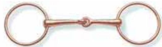
Loose Ring Snaffle